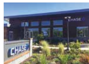
CHASE BANK (GL) California $9,200,000