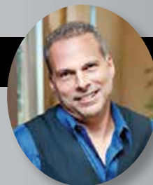
Paul M. Domb Asset Management

A: 2015 was strong for sellers primarily of existing net leased transactions. Sale leasebacks are United Trust Fund's only business and we are the oldest firm doing sale leasebacks. We have closed $382,000,000 YTD in 2015 and we expect to exceed that number next year.