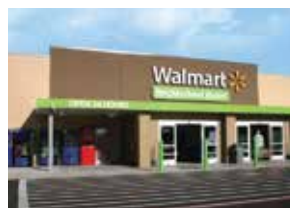
WALMART NEIGHBORHOOD MARKET (GL) PORTFOLIO Texas $11,658,797