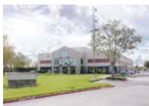
AT&T California $6,100,000