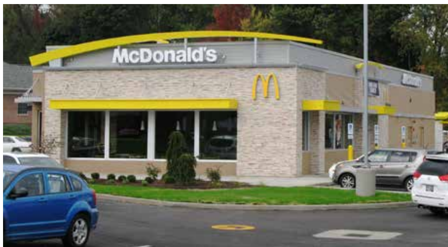
Quick-service restaurants are among the hottest net lease investments, with McDonald's leading the pack. This McDonald's in Canton, Ohio, was recently sold by CBRE.

Francisco Bay Area. "Individual investors required education on the features and benefits of single-tenant ownership. Today, some of the largest landlords of single-tenant properties are institutions. The attraction of little or no management associated with these properties is so appealing that the learning curve is much shorter."