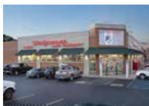
WALGREENS Tennessee $6,400,000