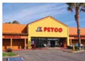
PETCO California $5,100,000