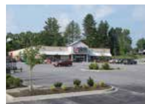
TRACTOR SUPPLY CO. North Carolina $4,082,645

For more information, please call +1 415 781 8100