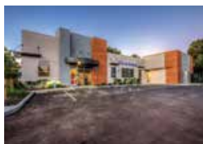
DAVITA DIALYSIS California $16,125,000

Our team successfully executed the following transactions on behalf of our clients.