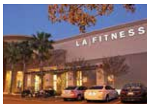
LA FITNESS California $14,500,000