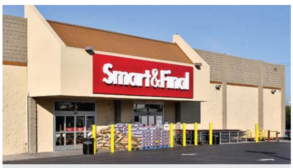
In December 2013, HIG NNN represented the seller in the sale of a single-tenant NNN Smart & Final in Fresno, Calif., for $6.3 million.

current tenant paying above, at or below market rent? Find out the past couple comparable leases that have been executed in the trade area. This information is extremely valuable to better understand if your tenant's rent is above or below market.