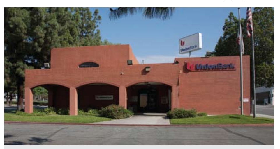
HIG NNN represented the seller in the sale of a 50-year, triple-net corporate ground lease to Union Bank in San Bernardino, Calif., for $1.85 million in October 2013.

HIG NNN represented the seller in the sale of a NNN corporate ground lease to Union Bank in San Bernardino, Calif., for $1.85 million in October 2013. Located on a corner pad to a well-trafficked Food 4 Less and Ross Dress For Less-anchored shopping center, the property sits adjacent to San Bernardino City Hall and Superior Court. The investment has strong upside potential due to Union Bank's rent being well below market with nine years remaining on the lease. The buyer was comfortable paying an aggressive capitalization rate on the current income because he knew market rent was at least 30 percent more than what Union Bank was paying.